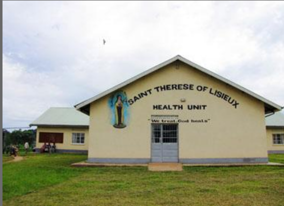
1) The functioning part of the medical infirmary