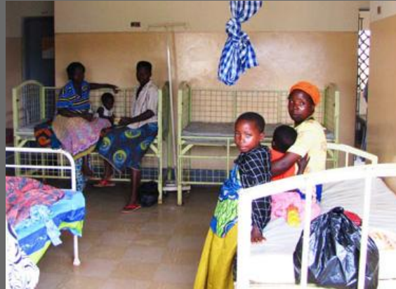
2) Inside the infirmary